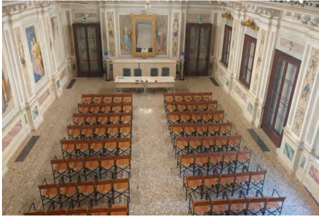
Sala delle feste (Feast salon)