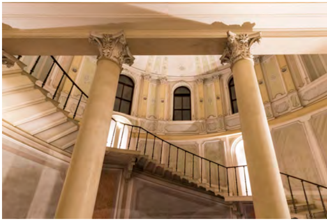
Scalone del Meduna (Meduna's staircase)