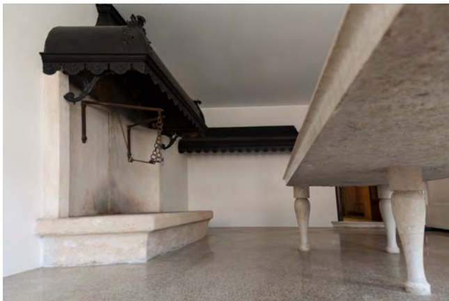
Cucina estiva (Summer kitchen)