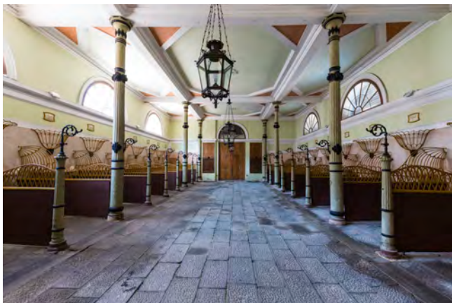
Scuderia (Horse stable)